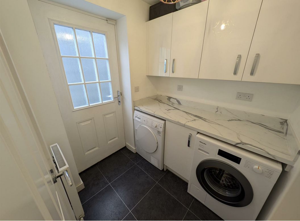
Garage 16'7" x 8'9"